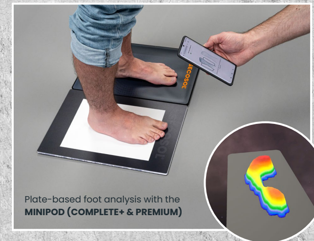
Plate-based foot analysis with the MINIPOD (COMPLETE+ & PREMIUM)