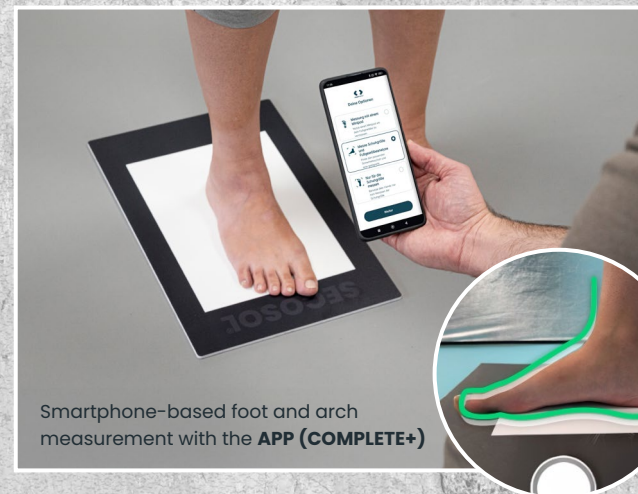
Smartphone-based foot and arch measurement with the APP (COMPLETE+)